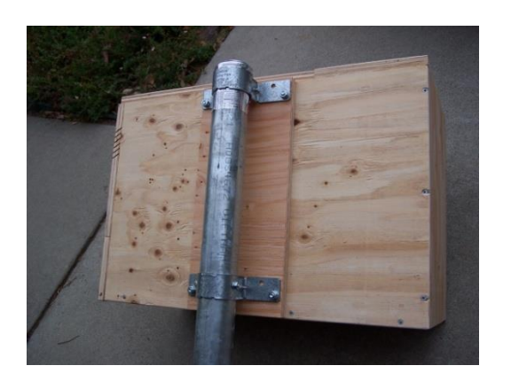
Figure 3. Mount back of nest box with pipe clamps