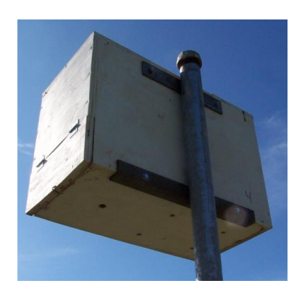
Figure 2 Mount by welding piece of angle iron