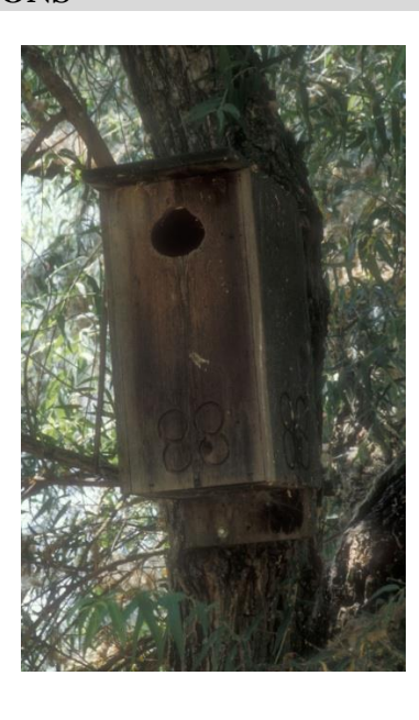
Functioning 10 year old Wood Duck nest box